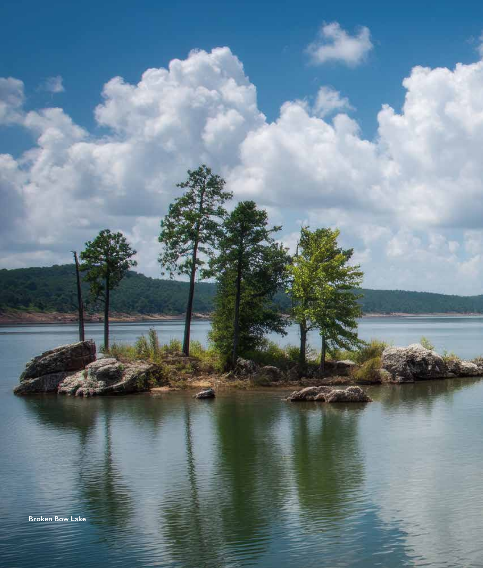
Broken Bow Lake